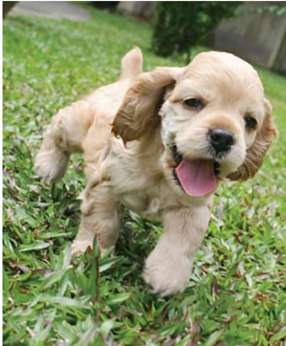
Puppies need exercise every day.

must play every day with high-intensity games like ball-fetch, tug-of-war, hide-and-seek or just free-play with other dogs.