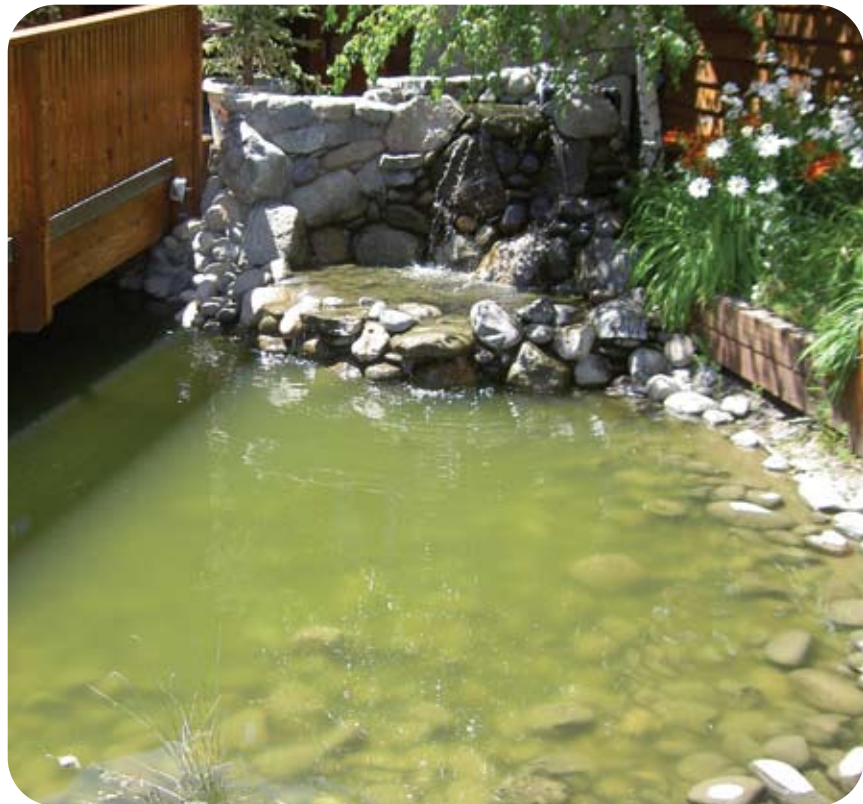
Algae – natural, but it’s not pretty. And it can take over a pond.