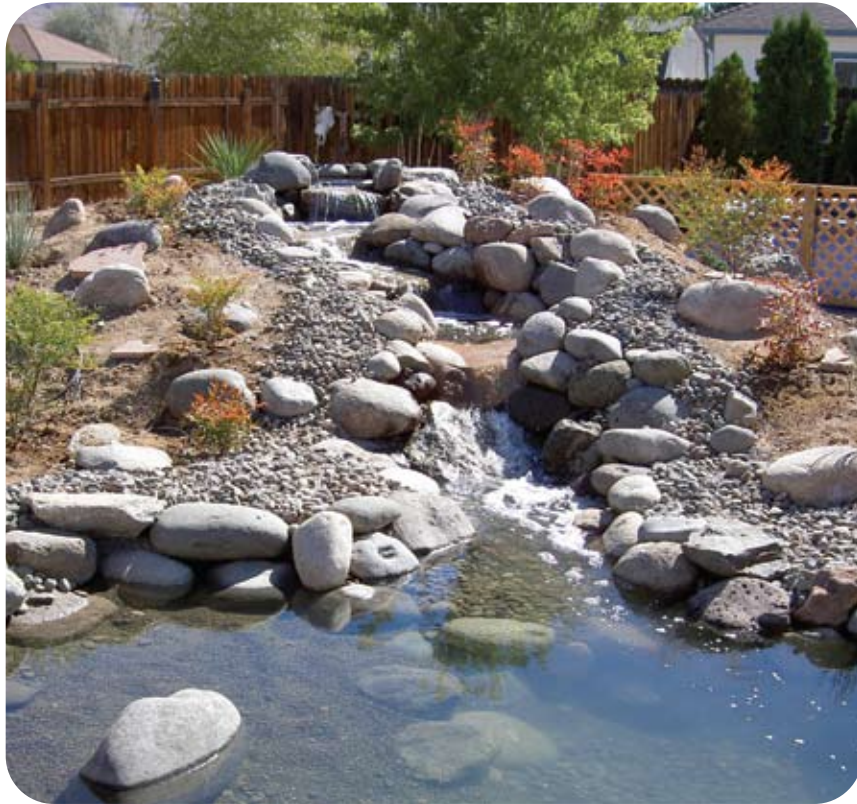
An eco-friendly water feature can include a pond such as this one.