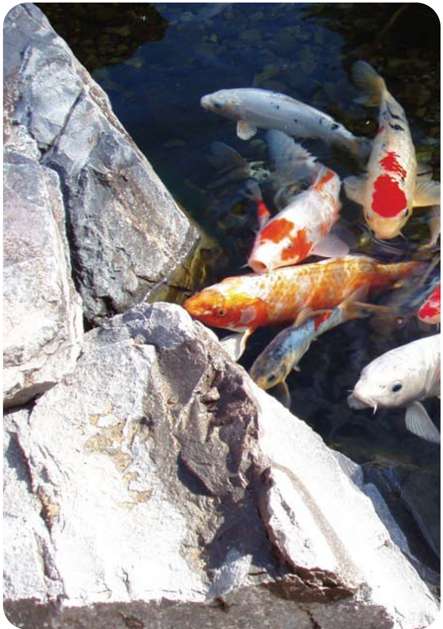
Eco-friendly ponds provide a natural home for Koi and other fish.