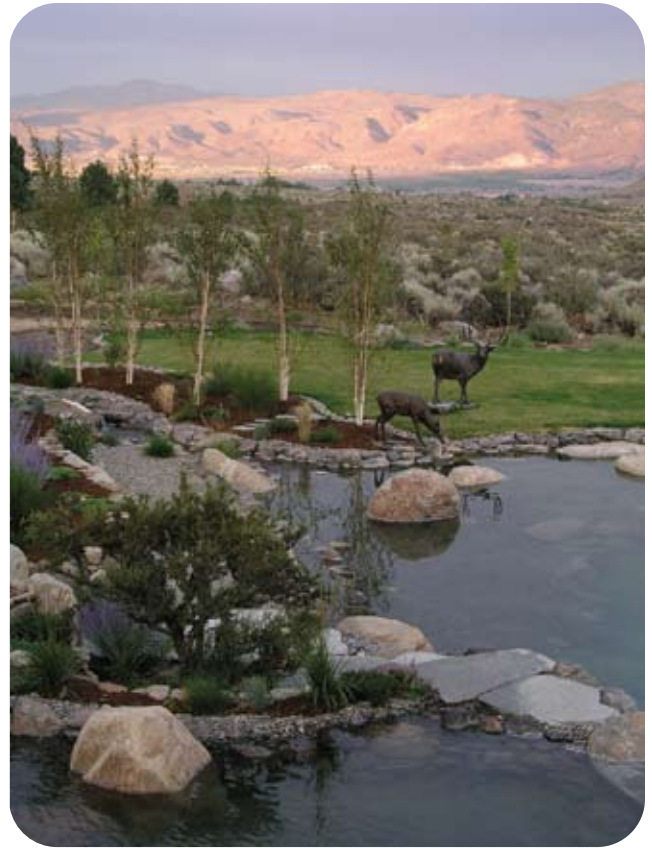
Though it looks like a natural lake, this pond is simply a large water feature.

Dayton's top suggestion for anyone considering this kind of change is to consult with a professional first. Also, seek out do-it-yourself seminars at landscape and nursery firms. Study the possibilities and read up on alternatives before you plan your water feature conversion.